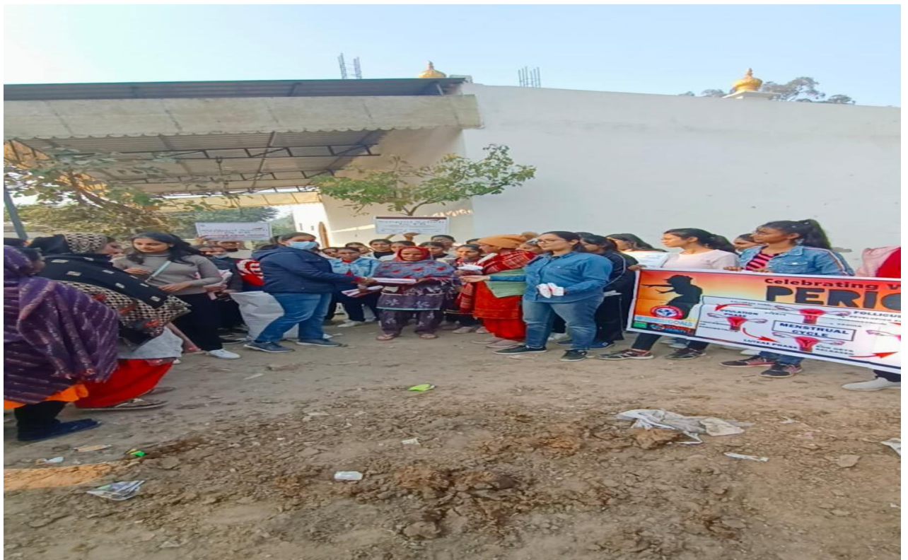
Visit to slum areas and distribution of sanitary pads on Dec, 2021