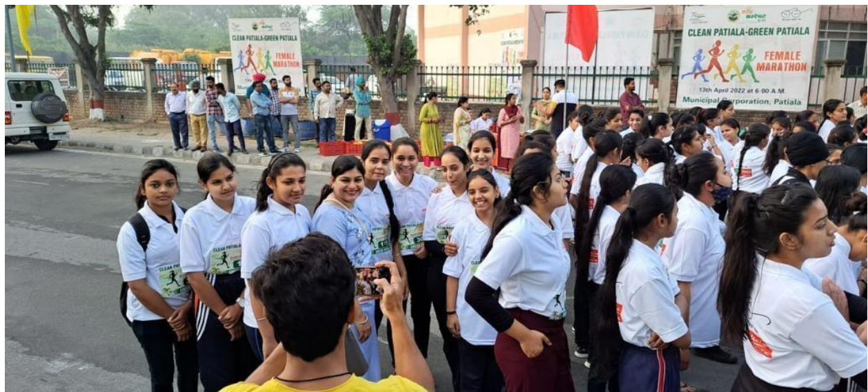
Women Marathon under program Clean Patiala Green Patiala on 13 April, 2022