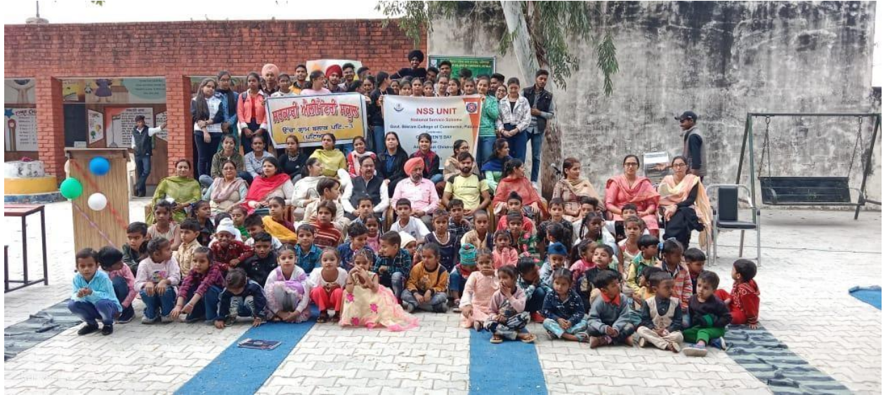
Visit to Elementary school, Ucha Gaon on 14 Nov, 2022.