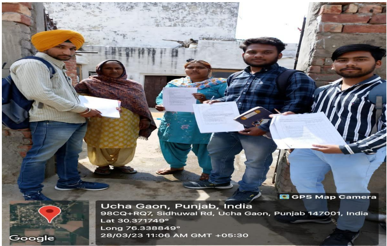
Visit to Village Ucha Gaon on 28 Mar, 2023