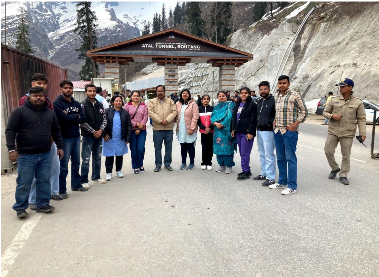
Visit to Atal Tunnel, Rohtang by staff and students on 14 Apr, 2023