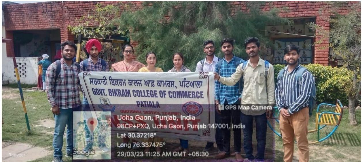
Visit to Village Ucha Gaon on 29 Mar, 2023