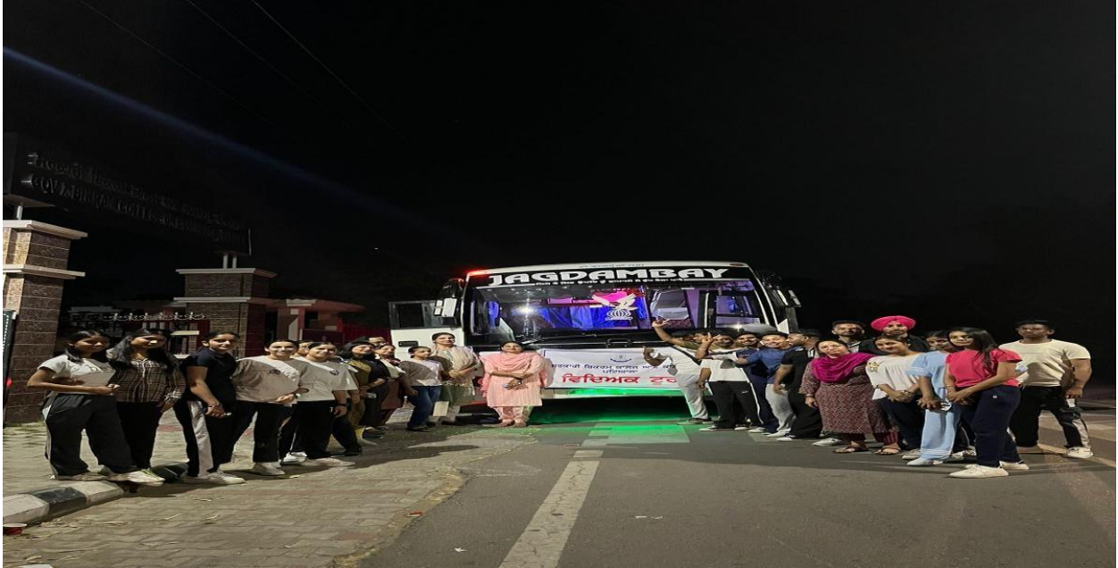
Students Ready for a Study tour on 10 March, 2023