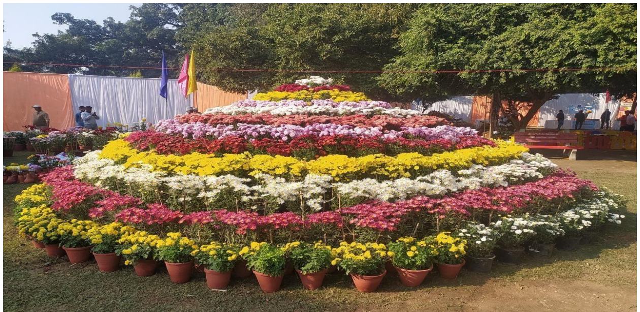
A visit to a flower show on 16 Dec, 2022 Baradari Garden, Patiala