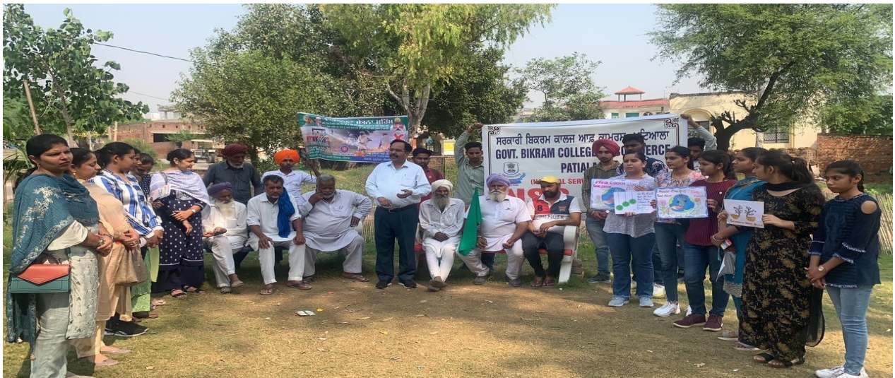
Visit to village Sidhuwal , The NSS Programme officers and NSS Volunteers creating awareness about stubble burning on 25 Nov, 2022