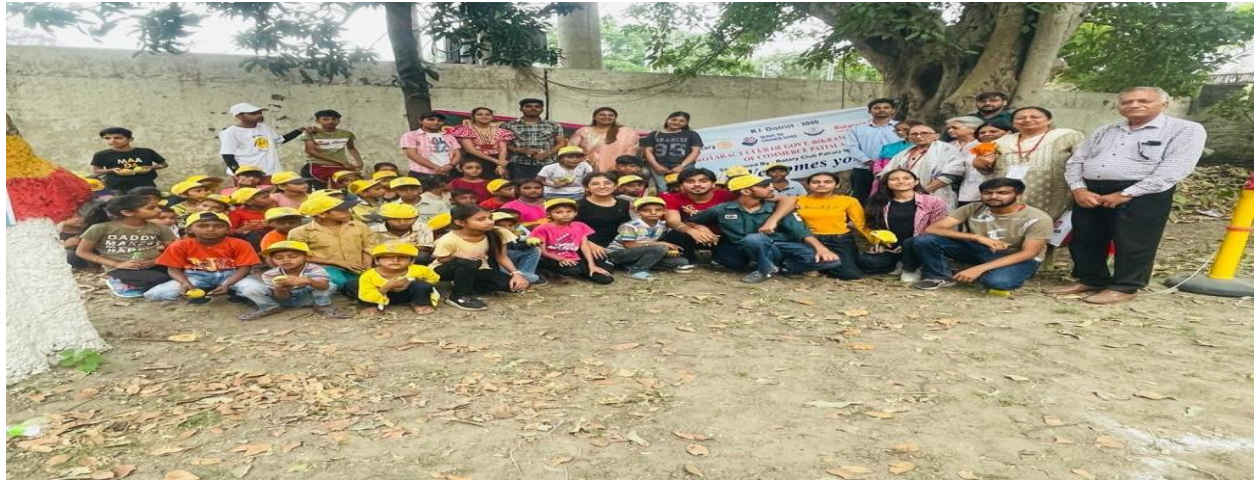
Celebration of sports day with students of Masti ki Pathshala By GBC Rotaract Club on 27 Apr, 2022