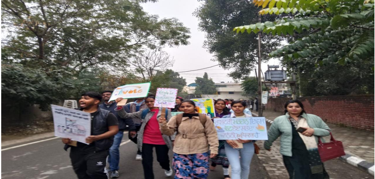
Voters' awareness rally by SVEEP