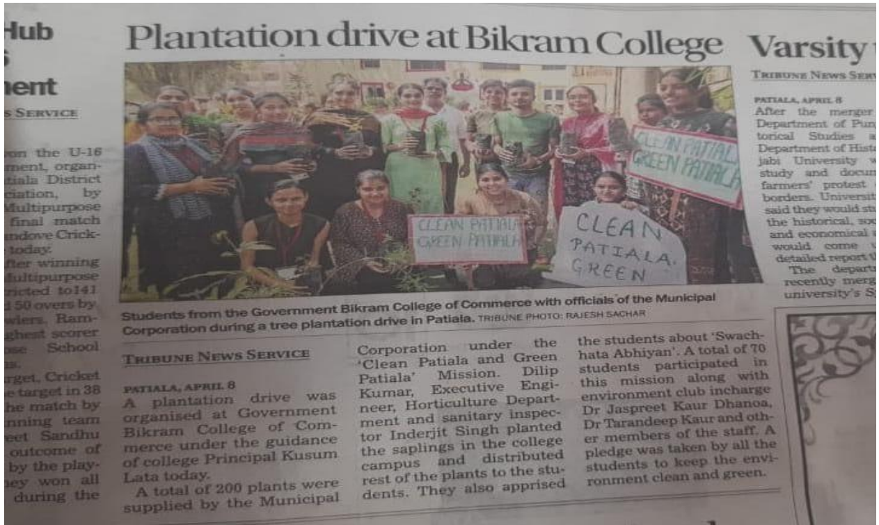
Plantation Drive by the college Students on 7 April, 2022