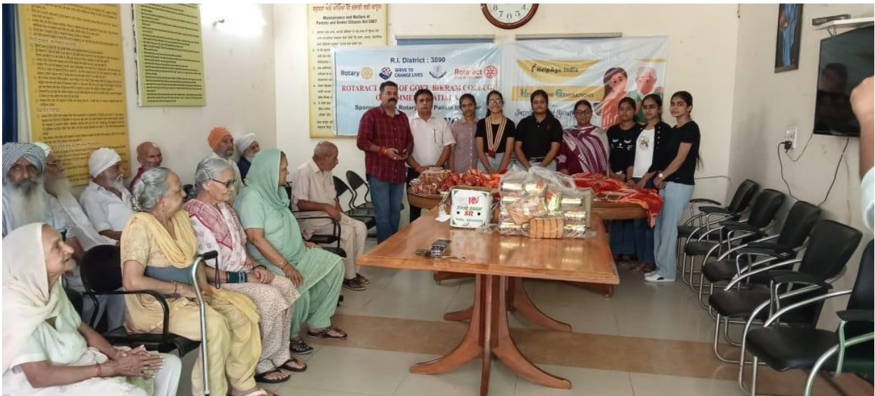
Student visited old age home near village Rongla 12 Aug, 2022